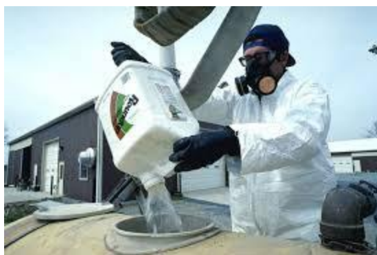
Keep container and pesticide below face level when pouring.

After measuring or weighing the correct amount of pesticide, carefully add it to the partially filled spray tank. When pouring, keep the container and pesticide below face level. If there is a breeze outdoors or strong air current indoors, stand so the pesticide cannot blow back on you. Rinse the measuring container thoroughly and pour the rinsate into the spray tank. Use caution while rinsing to prevent splashing. Never leave the spray tank unattended while it is being filled. When transferring wettable powders, dusts, or other dry formulations, avoid spillage and inhalation of dusts.