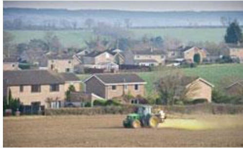
Be aware of wind speed, direction, and nearby sensitive areas.

Before applying a pesticide, clear all people and pets from the area. Remove toys and pet dishes from the application area and cover garden furniture, swimming pools, and birdbaths. Check the pesticide label to find out when it is safe to return to the application area. If the label does not include specific restricted-entry statements, keep people and non-target animals out of the treated area until the spray has dried or the dust has settled.