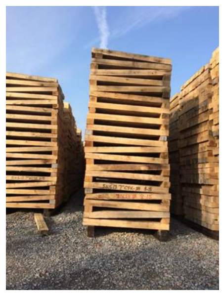
Air-drying rail ties

<u>Air-drying</u> is a widely used, effective and inexpensive method of conditioning. Wood should be dried as quickly as possible; the time will vary, depending on climate, location and condition of the seasoning yard, methods of piling, season of the year, and size and species of the timbers. Drying offers some protection against wood-decaying organisms. Decay fungi do little damage to wood with a MC below 20%. They are most damaging at MC's from above 30% to saturation, which is too wet for favorable fungal growth. Bark obstructs penetration. In most cases, it should be peeled from wood products to enable quick drying. This also helps to avoid decay and insect damage and allows the preservative to penetrate the wood satisfactorily.