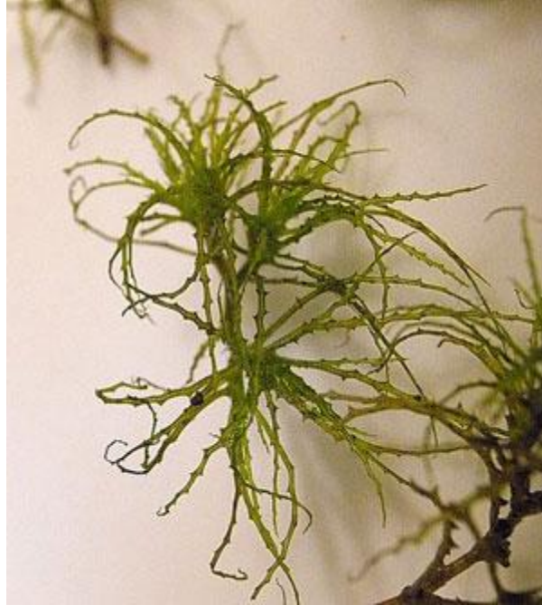
John Hilty, Illinois Wildflowers

Brittle naiad is a submersed annual aquatic plant that spreads by seeds and plant fragments. Its oppositely arranged leaves are 1 to 2 inches long and are toothed, stiff, and pointed. Brittle naiad resembles coontail but its leaves are in pairs while coontail leaves are in whorls of 4 or 5. It can form dense mats that outcompete native species and can interfere with recreational activities.