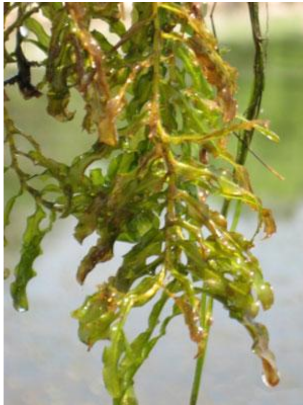
Chris Evans, University of Illinois, Bugwood.org

The leaves of Curly-leaf pondweed are somewhat stiff and crinkled, approximately 1/2-inch wide and 2- to 3-inches long. Small teeth are visible along the edges of the leaves, which are arranged alternately around the stem. Leaves become more dense toward the end of branches. The plant appears reddish-brown in the water but is actually green when pulled out and examined closely. Curly-leaf pondweed grows best in the spring and tends to die in the summer. It is common in ponds, lakes, and ditches.