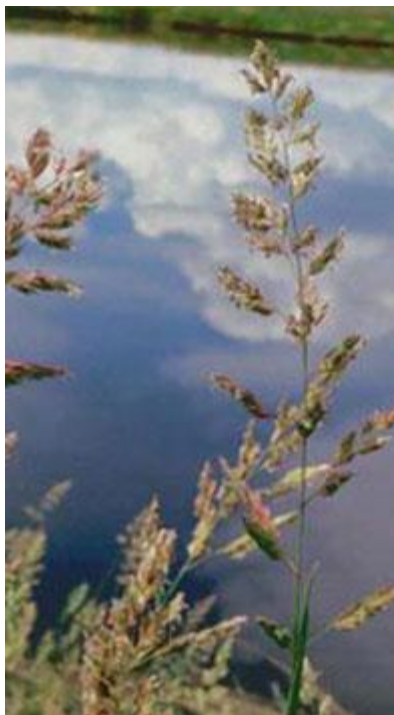
Reed canarygrass