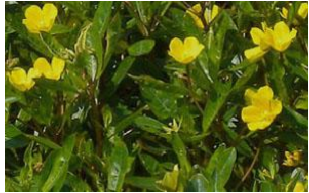
Creeping water primrose