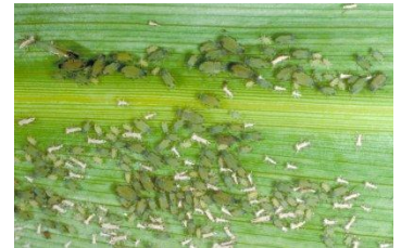
Corn Leaf Aphid

Despite these advances in pest management options, a large proportion of our corn acreage is planted with conventional corn hybrids. This may be due to market restrictions, production of food grade corn, production of corn for the bourbon industry, or just growers selecting cheaper seed to reduce input costs. What we have now is two different crops in terms of insect management, Bt corn and non-Bt corn, each with different insect pest concerns. With the non-Bt crops, we have the traditional key insect pests of corn including corn borers and rootworms. But with the Bt crop, primary pests are for the most part controlled well. Instead of the more common primary pests, there are a few uncommon secondary pests that growers of Bt corn need to watch for, and this includes, excessive wireworms, stink bugs, corn leaf aphids, and southern corn leaf beetle.