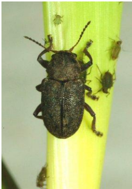
Southern Corn Leaf Beetle

Few crops, particularly major field crops, have seen such a dramatic evolution in pest management tactics as such a short period of time as what we have witnessed with field corn. Last year the acreage of Bt exceeded that of non-Bt nationally and within Kentucky. It is nearly impossible for growers to find corn seed that has not been treated with one of the systemic neonicotinoid insects, clothianadin or thiamethoxam , to control soil insect pests and help with stand establishment. Fifteen years ago we were much more reliant on field scouting, use of action and economic thresholds, and applying soil insecticides and sprays as needed. Growers now have the opportunity to select corn hybrids with stacked Bt traits that will control European corn borer, southwestern corn borer, black cutworm, corn earworm, fall armyworm, western corn rootworm, and northern corn rootworm. With the added protection of the seed treatment, seedcorn maggots, corn flea beetle, white grubs and wireworms are also managed.