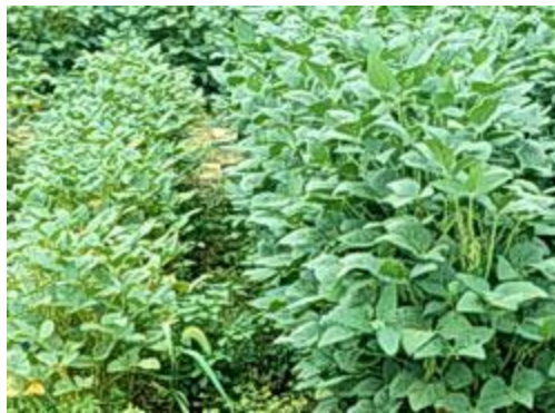
SCN-affected plants (left) vs. unaffected plants (right)

In Kentucky, the soybean cyst nematode (SCN) is the most damaging nematode disease. It feeds on the roots of soybean and other host plants. Feeding removes nutrients and disrupts nutrient and water movement. An infestation also reduces the production of nitrogen-fixing nodules and encourages other root diseases.