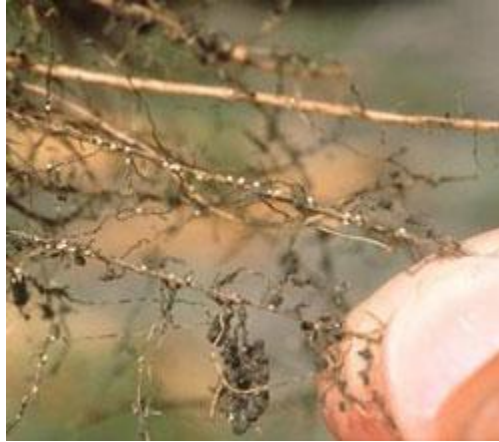
Cysts (bodies of female nematodes) are visible on diseased roots from four weeks after planting through the rest of the season