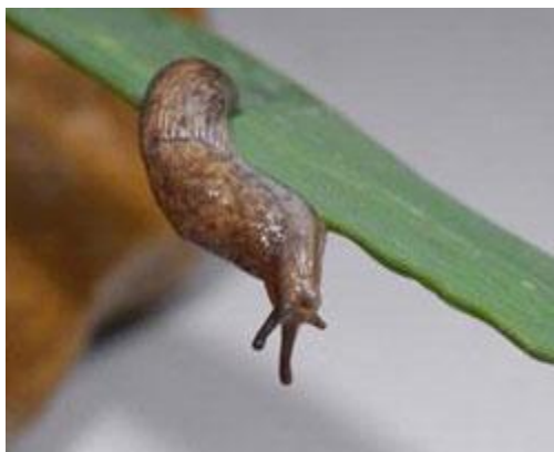
Joseph Berger, Bugwood.org

Tiny thrips tear plant cells and feed on sap. These tiny insects may leave feeding scars or distorted leaves; some can carry plant disease.