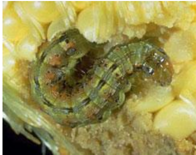
R. L. Croissant, Bugwood.org

The slender, light green caterpillars have three pairs of white stripes that run the length of the body. There are three pairs of legs near the head, three pairs of fleshy legs near the middle of the body, and a pair of fleshy legs at the tail end. Most soybean caterpillars have four pairs of legs near the middle of the body. GCW larvae wiggle violently when disturbed.