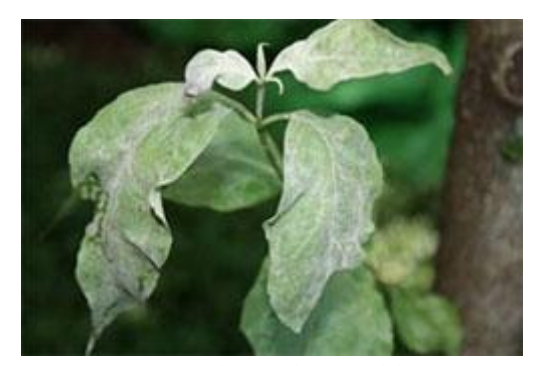
Dogwood powdery mildew

<u>Powdery mildew</u> The most common symptom is the white or gray layer of fungal growth produced on surfaces of the plant leaves and stems. Crooked stems or bubbled and curled leaves may develop If plant buds or very young tissue are infected.