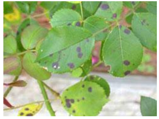
Black spot on Rose

Fungal leaf spots (such as anthracnose, scab, leaf blotch, or shot hole) can vary in size, shape, and color. Some spots have distinct margins and may be surrounded by yellow halos. Other types of spots may be angular or blotchy. Spots or dead areas may enlarge to cover an entire leaf. As the spots become more abundant, leaves may yellow, die, and drop. Usually, leaf spots occur first on the lower leaves and progress up the plant. Fungal growth in the spot may consist of tiny pimple-like structures or a moldy growth of spores. You may need a hand lens or microscope to see the symptoms.