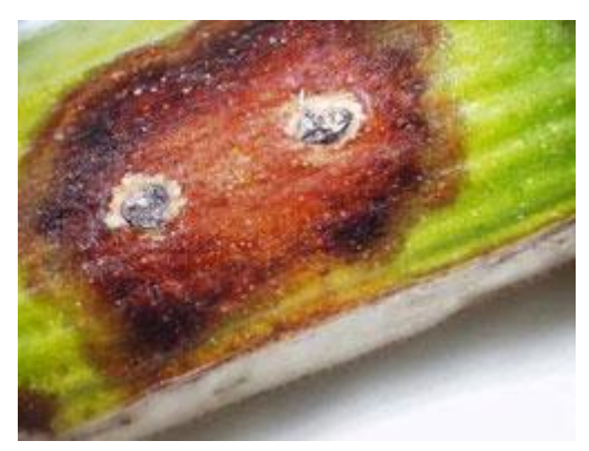
Stem canker on Japanese rose