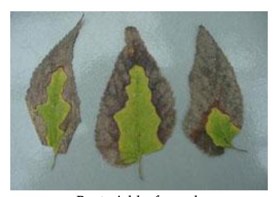
Bacterial leaf scorch

<u>Bacteria</u> are single-celled organisms that usually reproduce by simple cell division, some as often as every 30 minutes. They can build up quickly under warm, humid weather conditions. Leaf, growing shoots, and fruit diseases are the most common types in Kentucky.