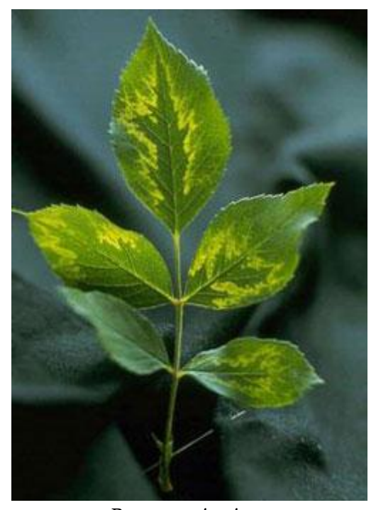
Rose mosaic virus

<u>Viruses</u> are too small to see with a microscope. Generally, they are recognized by their effects on plants. These include stunted growth; change in plant color; abnormal formation of infected roots, stems, leaves, or fruit. Mosaic diseases, characterized by light and dark blotchy patterns, usually are caused by viruses.