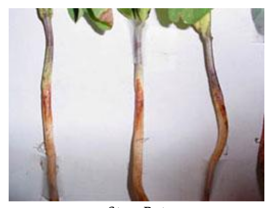
Stem Rot

The pathogens commonly associated with stem rot of ornamentals include the fungus-like water molds Pythium and Phytophthora , and the fungi Rhizoctonia , Sclerotium , and Botrytis . All are common soil-inhabiting fungi.