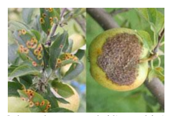
Cedar apple rust on apple foliage and fruit

<u>Rusts</u> often produce spots called pustules that are similar to leaf spots. Pustules may be on the upper and/or lower leaf surface. They contain brown, reddish brown, orange, or yellow spores. Rust pustules are usually raised above the leaf surface. Rubbing the affected leaf surface will leave a dusty rust color (caused by the spores) on your fingers. Rust fungi may also attack twigs, branches, and fruit. They are often carried by wind and can be blown from infected plants to healthy plants, spreading the infection.