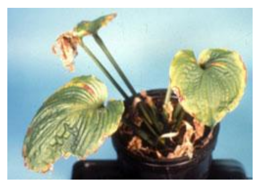
Foliar nematode damage on Hosta

The life cycle of a nematode includes an egg, several larval stages, and an adult. Most larvae look like small adults.