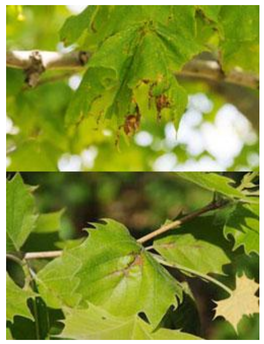
Anthracnose of Maple (top) and Sycamore (bottom)