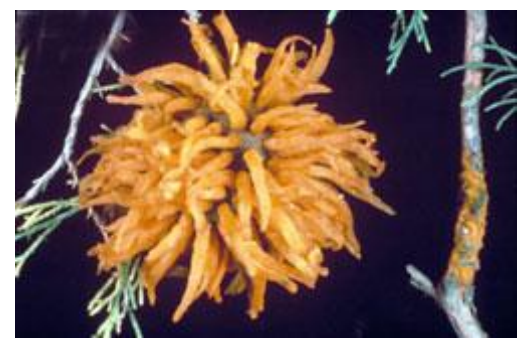
Cedar-apple rust with telial "horns" (left) and cedar-quince rust (right)