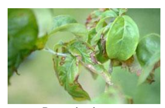
Dogwood anthracnose

<u>Leaf blights</u> may have the same effect on plants as leaf spots but are generally larger diseased areas and have less regular shapes.