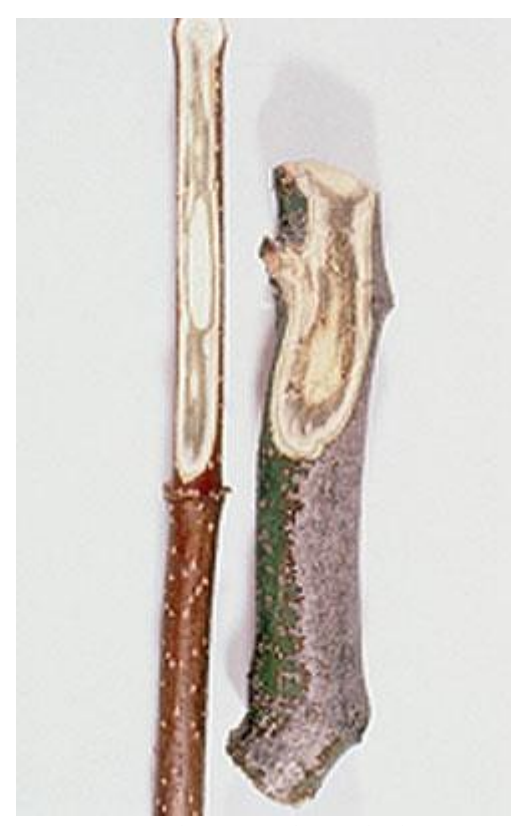
The Verticillium dahliae fungus causes this vascular wilt disease on hundreds of woody plants

Fungal pathogens such as Fusarium , Verticillium , and Ophiostoma can cause wilting of many ornamental species by restricting the water flow to leaves and stems. The wilting caused by such pathogens is sometimes due to the toxins they produce. Other pathogens can build up within water-conducting vessels, which become plugged by fungal growth.