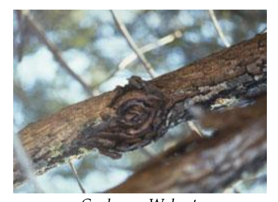
Canker on Walnut

<u>Cankers</u> are localized sunken lesions areas on trunks, stems, or branches of woody plants. Canker diseases cause bark tissues to shrink and die. The dead tissues often crack open and expose the wood underneath.