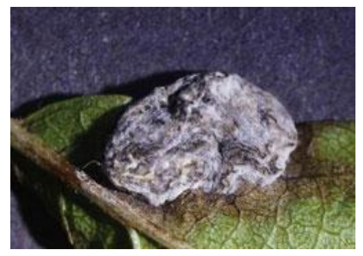
Leaf gall on lowbush blueberry

Leaf gall diseases are caused by fungi and are favored by cool, moist weather. However, most galls seen on plants are caused by insects or mites.