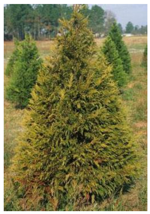
Phytophthora Root Rot