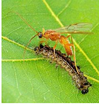
Beneficial wasp laying its eggs in a caterpillar

The larvae of many beneficial wasps develop in the bodies of caterpillars. Adult wasps can be very selective when choosing prey.