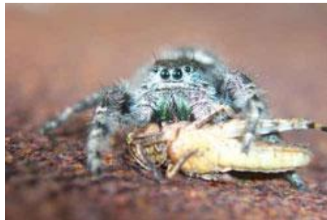
Jumping spider with grasshopper

The seven-spotted lady beetle is a medium-sized, orange beetle with seven black spots. It is a European species that was introduced into the US to aid in managing some aphid pests.