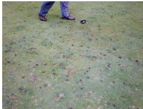
Worm castings on golf course (Penn State)

Earthworms and nightcrawlers are not insects but they can be abundant in soil. These annelids help to recycle organic matter and their burrows allow oxygen and water to enter the soil more easily. However, when many are present, their activities and casting can cause the surface to be very lumpy. In addition, new species ( green stinkworms , Asian yellowworms ) are beginning to appear in some locations. These worms can cause significant problems in lawns, athletic fields and on golf greens.