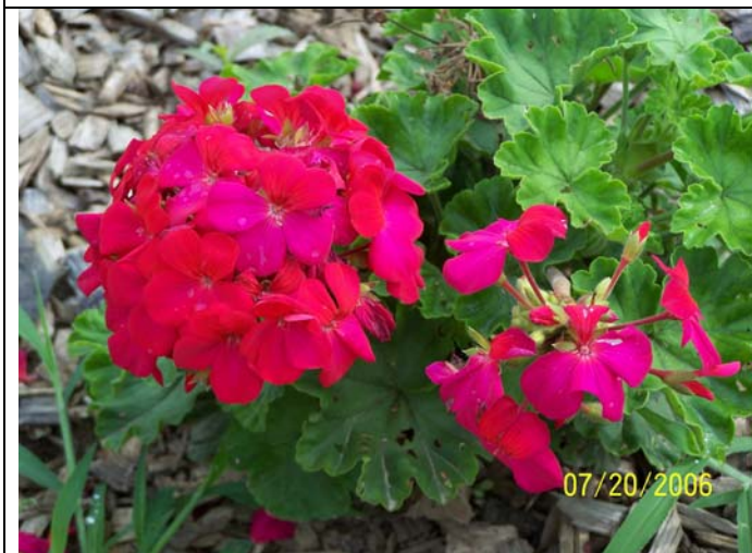
'Score Violet' seed geranium from Pan American Seed in Kentucky Master Gardener trials.