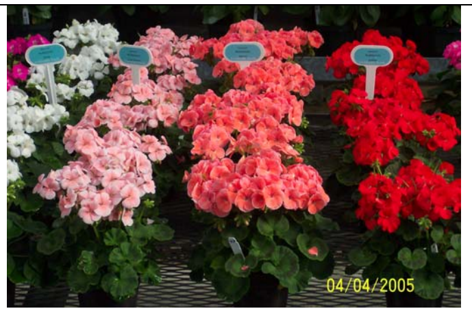
'Multibloom' seed geraniums