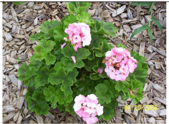
'Score Appleblossom' seed geranium in Kentucky Master Gardener trials.