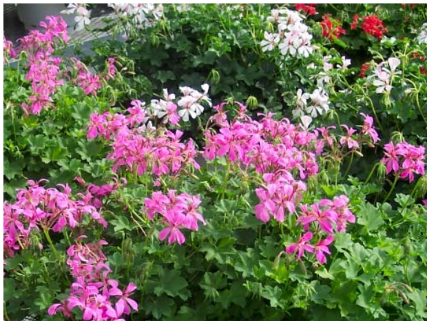
Lavender and white single flowered ivy geraniums at trials at Fischer USA.

Fischer USA - http://www.fischerusa.com - 'Cascade' series, 'Blizzard' series, and many other cultivars.