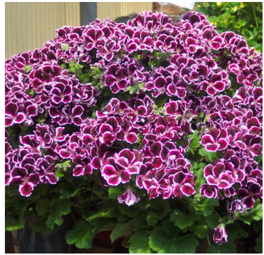
'Elegance' regal geraniums from Oglevee.