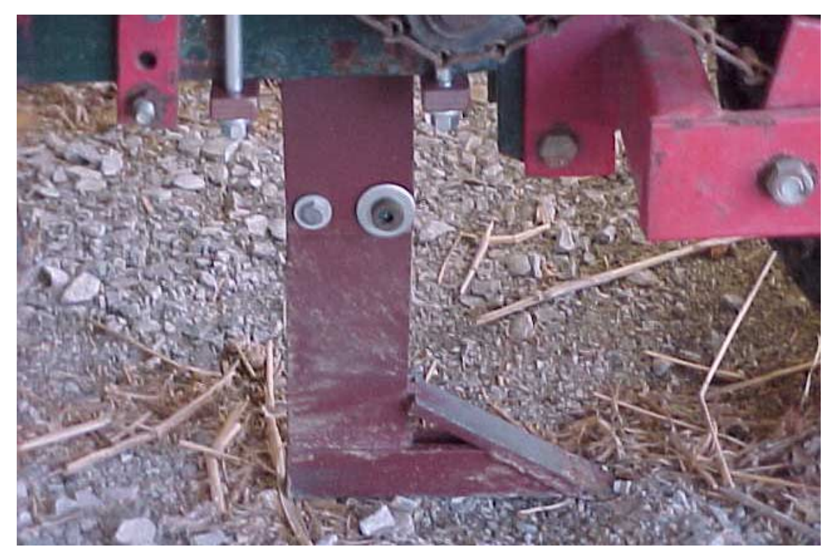
Figure 5. Subsurface tillage shank attached to unit frame.