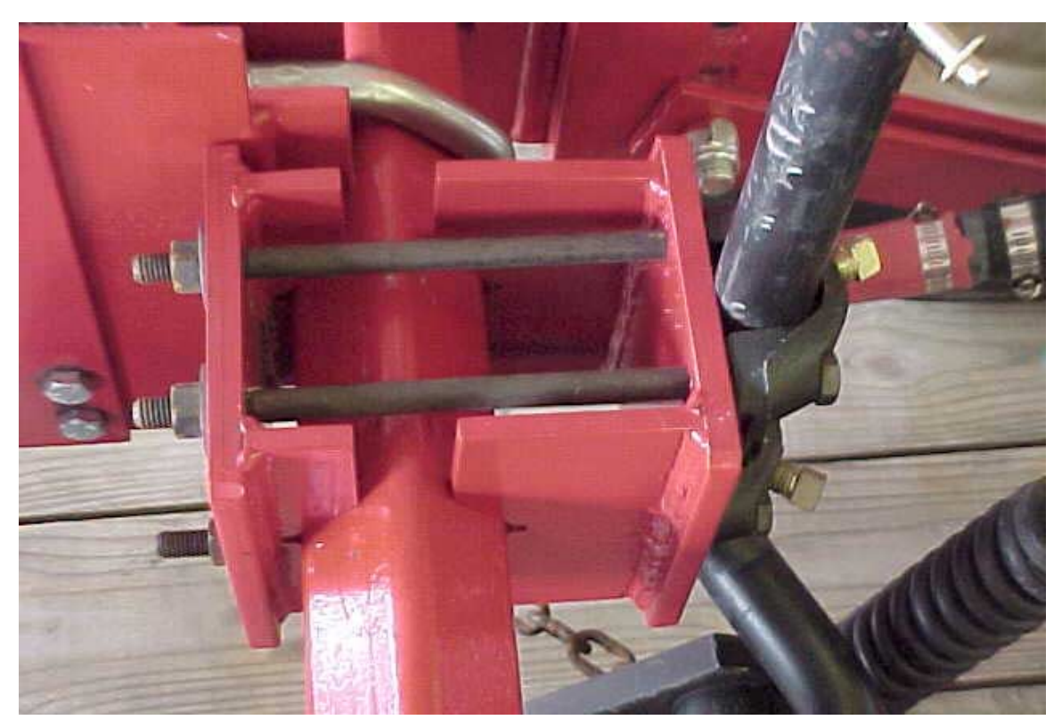
Figure 2. Coulter mounting bracket on to 2x2 toolbar.