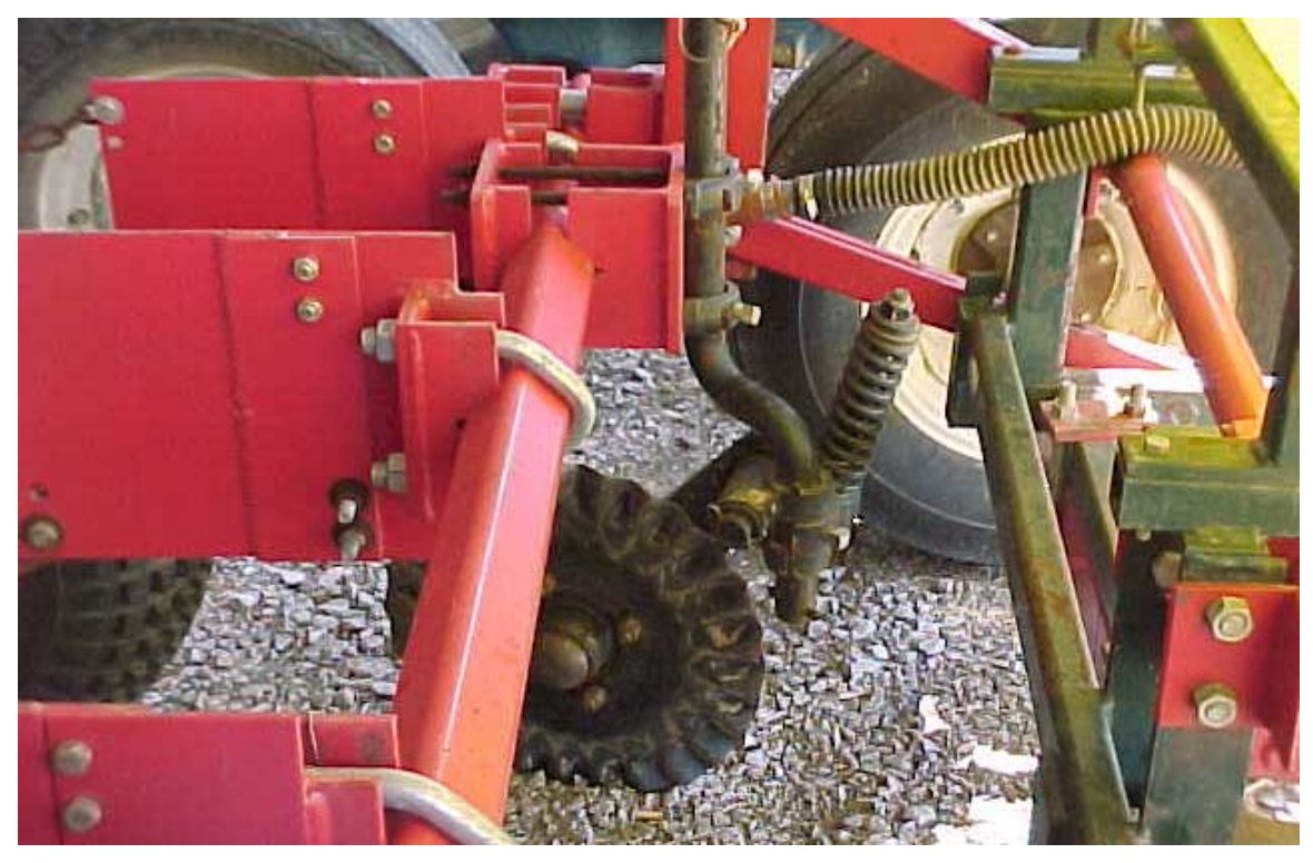
Figure 3. No-till coulter showing ripple blade