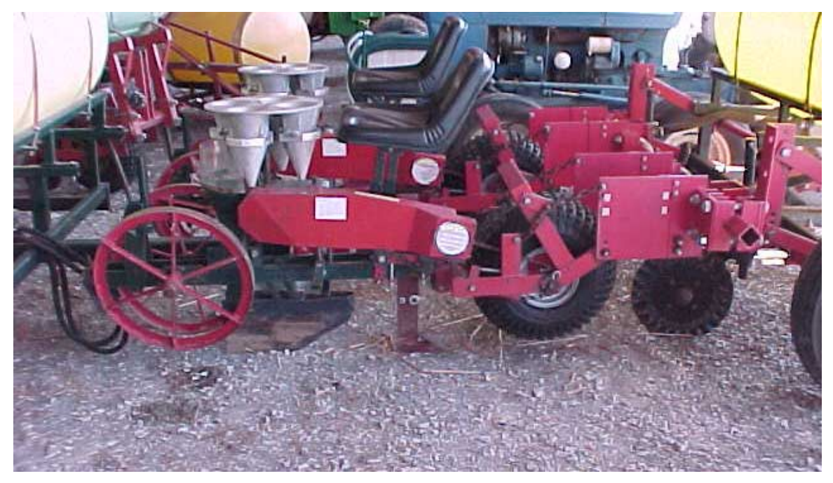
Figure 1. Two row Mechanical Model 6000 transplanter modified for use in no-till conditions.