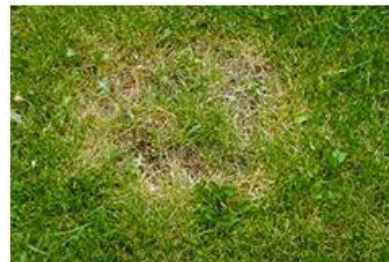
Figure 8. Necrotic ring spot on Kentucky bluegrass.

I discourage the use of fungicides for these diseases in lawns and landscapes. If these diseases continue to cause an unacceptable level of damage even after implementing cultural management practices, a better solution is to interseed perennial ryegrass into affected areas (to mask the symptoms) or renovate to a non-susceptible grass species like tall fescue.