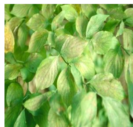
Figure 2. Dogwood leaves fading and yellowing due to powdery mildew disease.

of the causal fungus can just barely be seen (Figure 3), and occasionally, small patches of the fungus are fairly visible. Often the disease begins as barely distinguishable reddish brown or purplish irregular blotches on dogwood leaves which then develop into dark brown to tan dead patches (Figure 4). Later in the season, the tips and edges of infected leaves may be scorched, cupped, and drooped (Figure 5), with badly infected leaves falling prematurely. Throughout the season, the typical white powdery mildew mycelium and spores may develop abundantly on new growth, distorting and curling these youngest leaves (Figure 6). It is likely that many of these curled leaves will later become scorched or develop dead patches. The disease increases progressively from early June to early September. Severely affected trees may appear wilted and browned by late summer (Figure 7). Landscape dogwoods exposed to sunlight and dry soil conditions may be especially scorched.