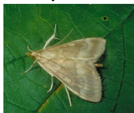
Figure 1. European corn borer moth.

The moths of the first generation European corn borer are beginning to emerge in western Kentucky with the rest of the state to follow shortly. With much of the corn crop planted late this year, growers will need to watch the late planted crop carefully for corn borer activity as late planted corn is more vulnerable to losses by this generation. Fortunately, much of the late planted corn has Bt for corn borer control. Pepper producers will also need to begin corn borer management with the onset of the second generation larval emergence. It is the second generation during mid summer that attacks under the cap of the fruit to destroy the pepper. Controls for corn borers are preventative in that the larvae must be controlled before they get into the fruit. See the accompanying chart for relative degree day accumulations at various Kentucky locations.