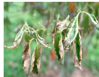
Figure 5. Late summer scorched and curled dogwood leaves due to powdery mildew.