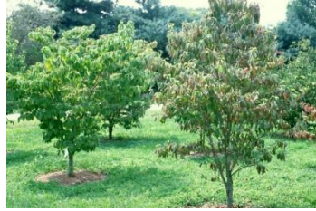
Figure 7. Mildew-infected (right) and healthy (left) dogwoods in late summer.

How powdery mildew affects dogwoods. Although it probably weakens trees, powdery mildew does not appear to be lethal. We have observed that under high disease pressure, flower production is decreased the following year. Powdery mildew reduces plant photosynthesis and increases leaf water loss through disruption of the cuticle and through the superficial fungal mycelium. In the long run, this could weaken trees making them more prone to dogwood borer or Botryosphaeria canker. Most landscape dogwoods are grown from seedling sources, so the mildew susceptibility of individual dogwood trees in landscapes varies greatly.