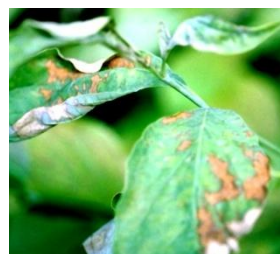
Figure 4. Dead patches on dogwood leaves due to powdery mildew.