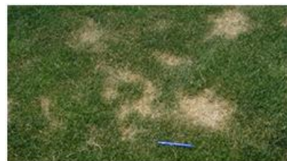
Figure 9. Necrotic ring spot of Kentucky bluegrass.