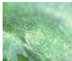
Figure 3. Sparse growth of powdery mildew fungus on leaf surface (under low magnification).