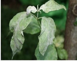
Figure 6. White superficial mycelium and spores, signs of powdery mildew on new dogwood shoot growth.