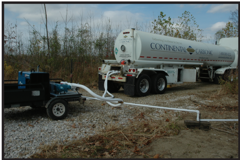
Liquid CO 2 being off-loaded from tanker truck (20 ton capacity) into injection pump where CO 2 was pressurized to 850 to 1,350 psi as it was injected into the Euterpe test well. Transfer lines are white due to frost as the CO 2 in the lines was very cold (-109°F).