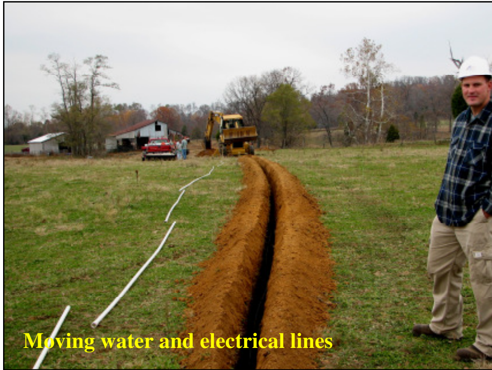
Moving water and electrical lines