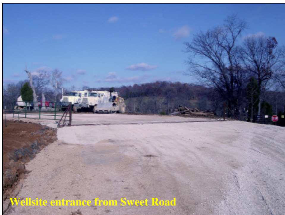
Wellsite entrance from Sweet Road