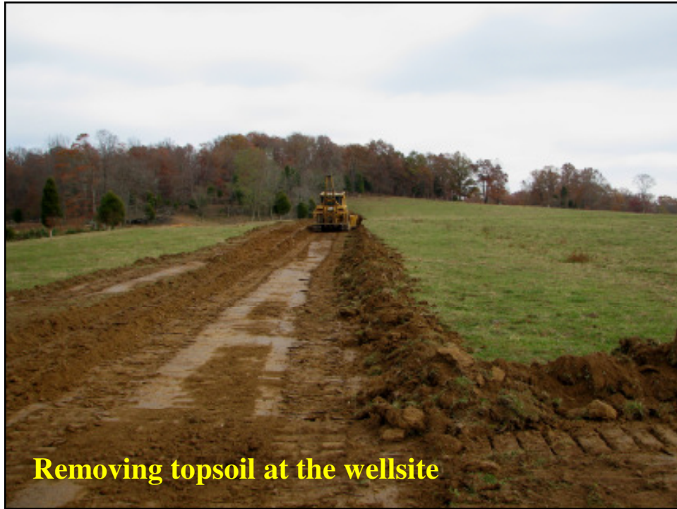
Removing topsoil at the wellsite