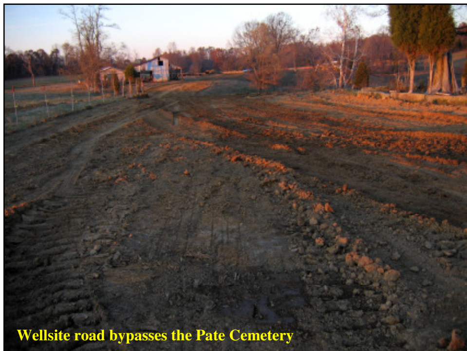
Wellsite road bypasses the Pate Cemetery