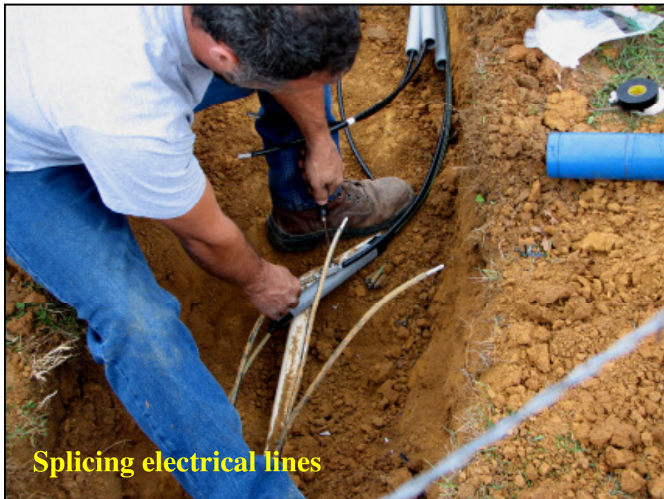
Splicing electrical lines