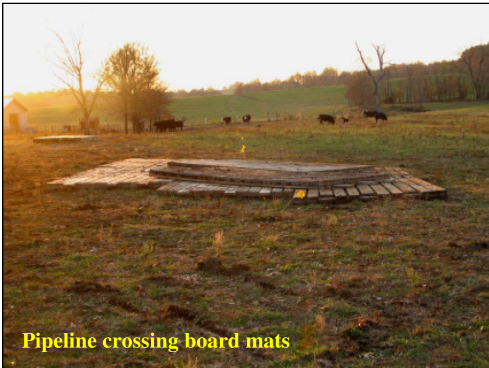
Pipeline crossing board mats