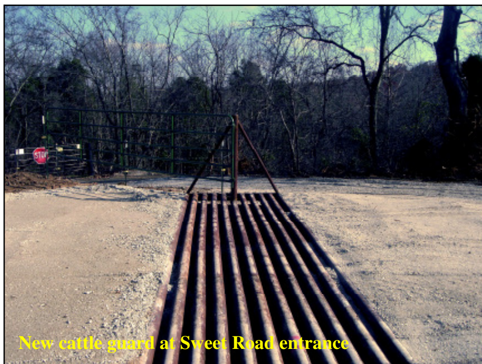
New cattle guard at Sweet Road entrance