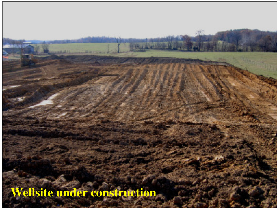
Wellsite under construction