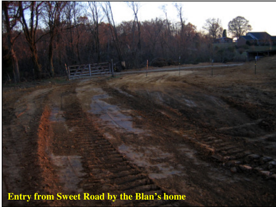
Entry from Sweet Road by the Blan's home