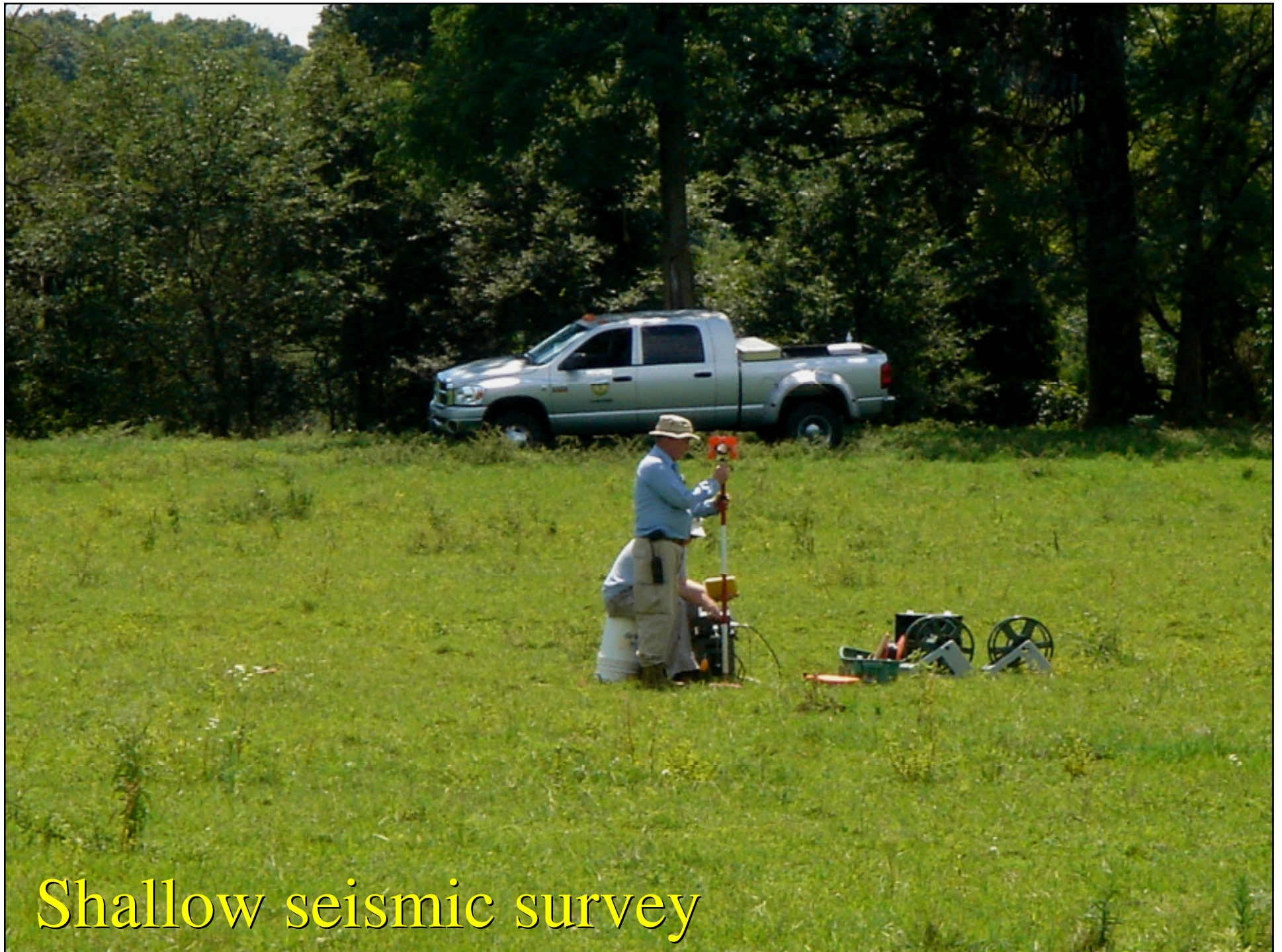
Shallow seismic survey