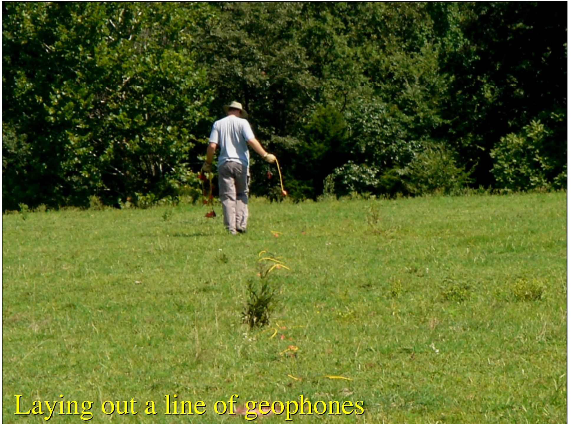
Laying out a line of geophones