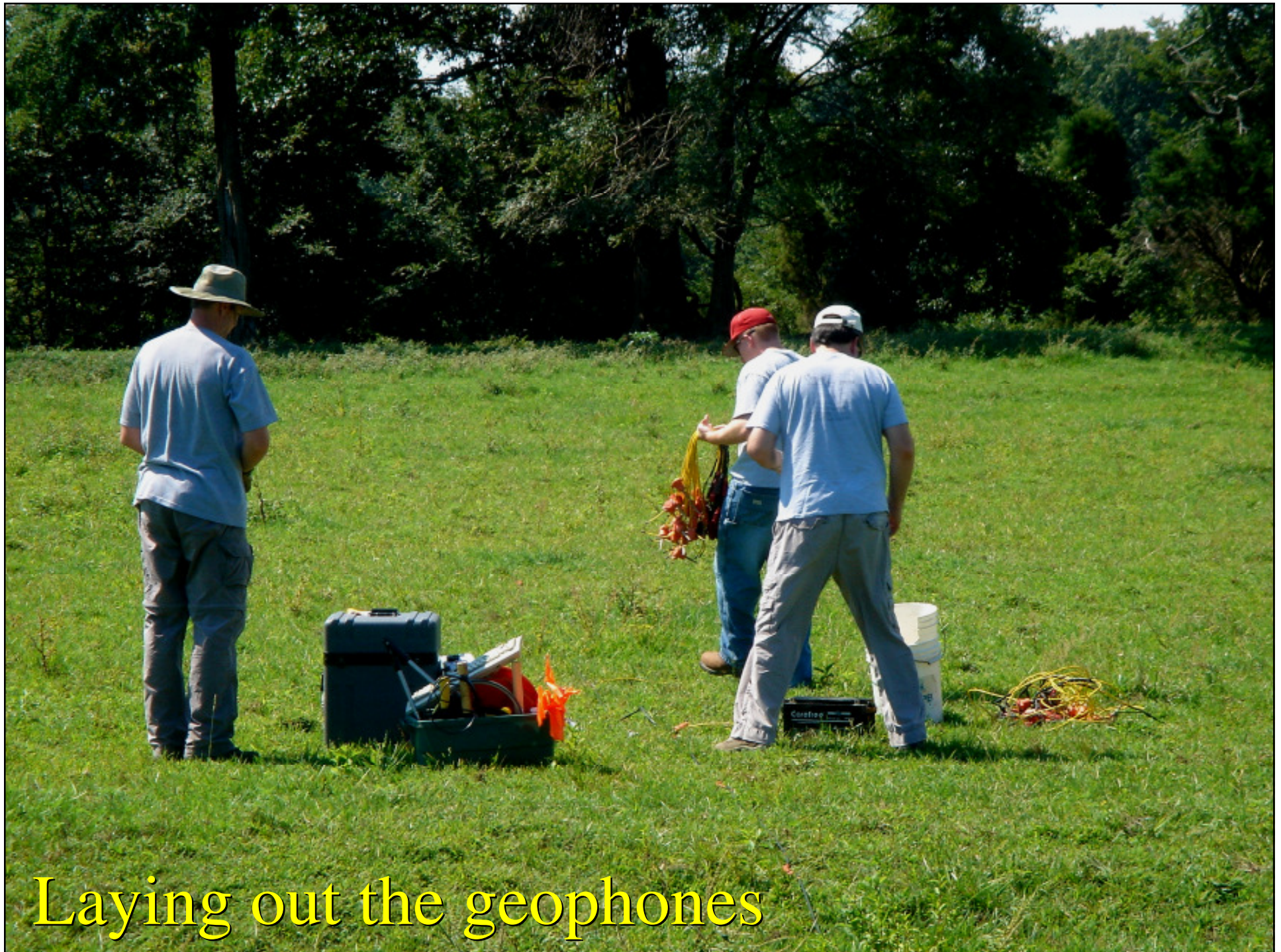
Laying out the geophones