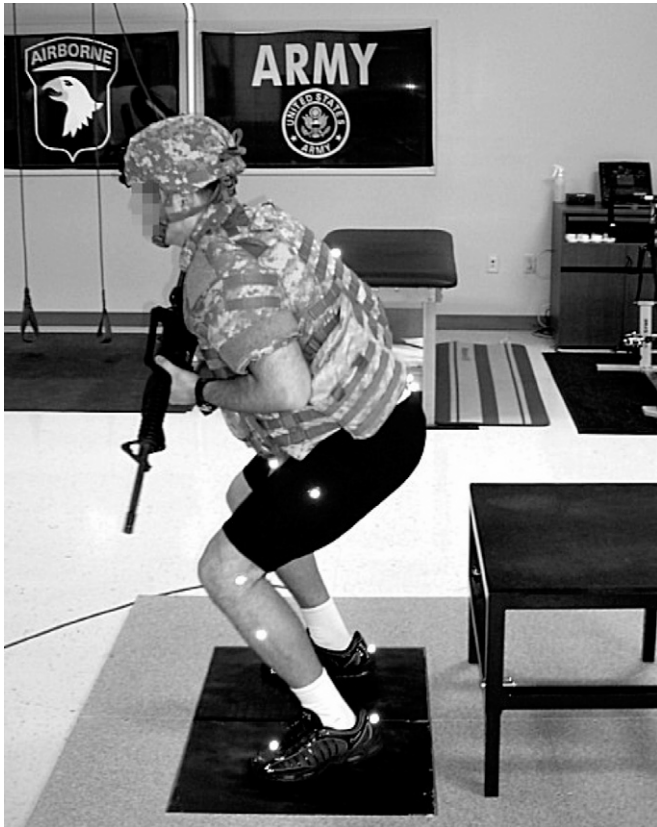
FIGURE 1. Two-legged drop landing task, IBA condition.

The 3D coordinates of the video-captured reflective markers were reconstructed and synchronized with the VGRF data using Vicon Nexus software (Vicon Motion Systems,