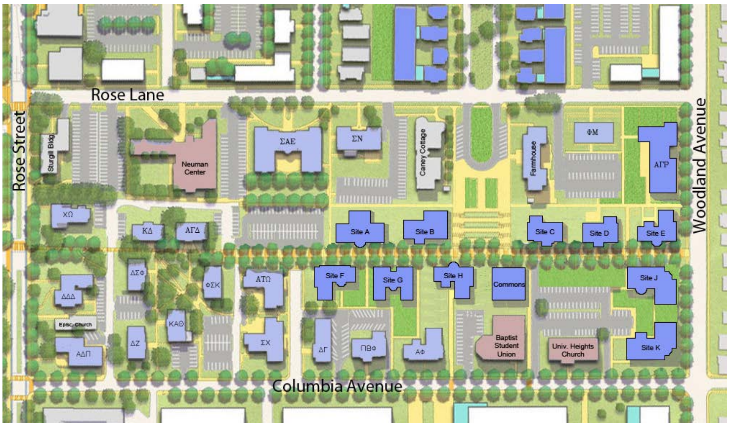
Sasaki Greek Park Plan