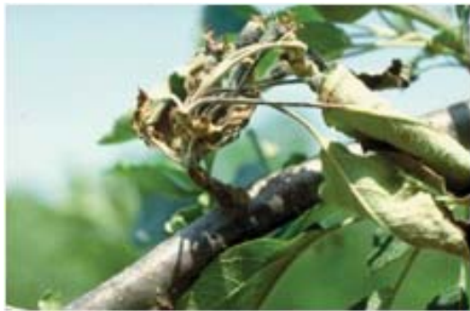
Figure 4. Apple blossom/fruit spur killed by fire blight.

When blossom blight occurs, early symptoms often show ooze droplets or browning of blossom pedicels. The infection of a single flower in a cluster usually kills the entire spur (Figure 4).