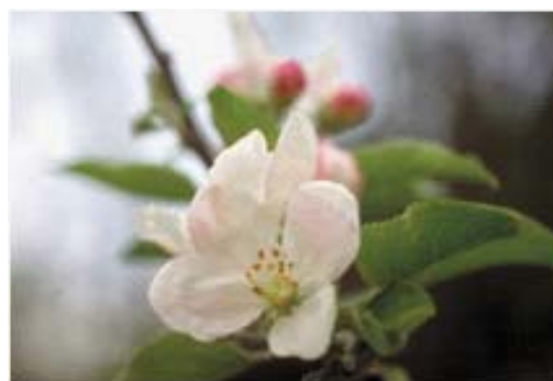
Figure 2. Apple blossom open and susceptible to infection.

may be infected and degree of bacterial colony growth. Wetness is the potential trigger of infection, as water moves the bacteria into the nectaries.