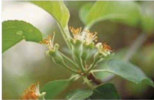
Figure 3. Apple blossom at petal-fall stage and no longer susceptible to infection.

be evaluated with forecasted temperatures. Thus, managing primary infections of the tree via the flowers can be aided substantially through the use of Maryblyt or Cougarblight. By knowing daily high and low temperatures, rainfall, and tree development stage the computer or the grower calculates when fire blight infections have occurred or when they are likely to occur.