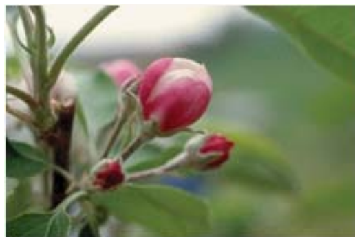
Figure 1. Apple blossom at the pink stage, not susceptible to fire blight infection.

To predict whether or not a threat from fire blight exists one must know how much bacterial growth might occur on the stigmas of apple and pear flowers. This growth is temperature dependent, so prediction of infection risk requires knowing the temperature while flowers are open (Figures 1, 2, & 3) using degree hour data or average daily temperatures and relating it to rate of bacterial growth at similar temperatures in the laboratory. These calculations, based on recorded temperatures, are done by the computer or they can be done using specially prepared charts. Temperatures determine both the number of days the flower