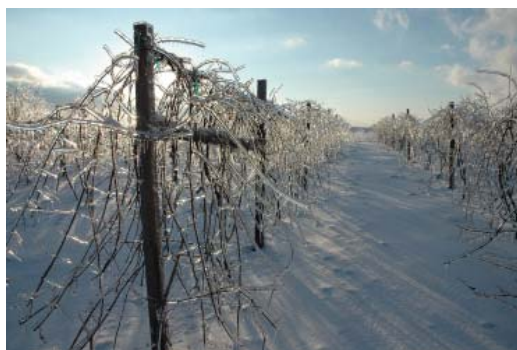
(Not so long ago... Frozen vineyard

UK is teaming up with the Kentucky Farmers' Market Association to conduct research that will help markets quantify the potential benefits from participation in this program. The cost versus benefit analysis will help farmers' markets determine if they are likely to generate enough business to make it feasible to invest in their own debit/EBT machines and follow the necessary protocols involved with participation.