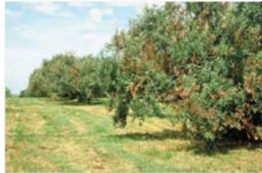
Figure 5. Apple orchard with numerous dead shoots killed by fire blight.

Some Kentucky growers have used the disease models to determine whether or not to spray. Several years ago, the Maryblyt system was used to calculate the need for fire blight applications by participating Kentucky apple growers. In years with low disease pressure, growers saved one or more streptomycin sprays, with no decrease in tree health, by following these recommendations.