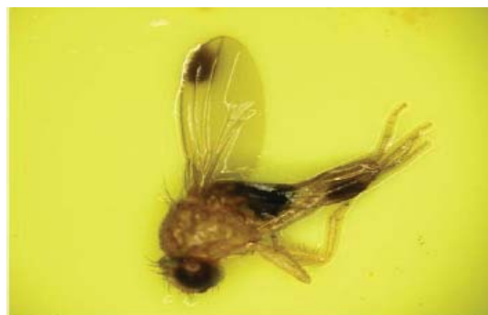
Figure 3. Male spotted wing Drosophila with the characteristic wing spot.

The USDA APHIS confirmed spotted wing Drosophila from the samples we had submitted from a fruit fly trap we had placed in south central Kentucky. This invasive originally from Asia is a very serious pest of our softer skinned fruits including blackberry, raspberry, grape, strawberry, blueberry, cherry, mulberry, and peach. Other harder fruits, such