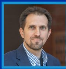
Thomas Dziubla College of Engineering