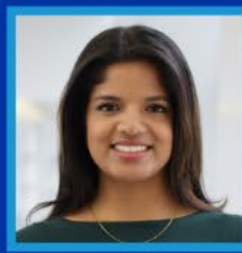
Jean Edward College of Nursing