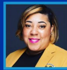
Mia Farrell College of Agriculture, Food and Environment