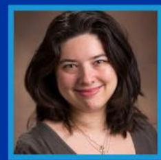
Kyra Hunting College of Communication and Information