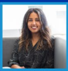
Aanya Chugh College of Design