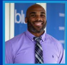
Kenneth Tyler College of Education