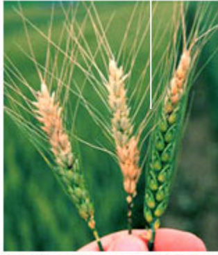
Wheat spikes with symptoms of Fusarium head blight

Beginning immediately, Folicur 3.6F may be applied to wheat at Feeke's stage 10.5 for Fusarium head blight/DON suppression, according to a Crisis Exemption declared by the Kentucky Department of Agriculture. The Crisis Exemption has been issued now, because some wheat in the state will be flowering beginning early next week and the recent rain has made the need immediate. The Crisis Exemption is good through May 6, 2005. The Crisis Exemption buys EPA an additional 15 days to continue to work on our section 18 application submitted in Mid-January. Anyone applying Folicur will need to have a copy of the Folicur Crisis Exemption label in their possession at the time of application. A copy of the emergency label can be requested at the Jefferson County Extension Office. Telephone: (502) 569-2344