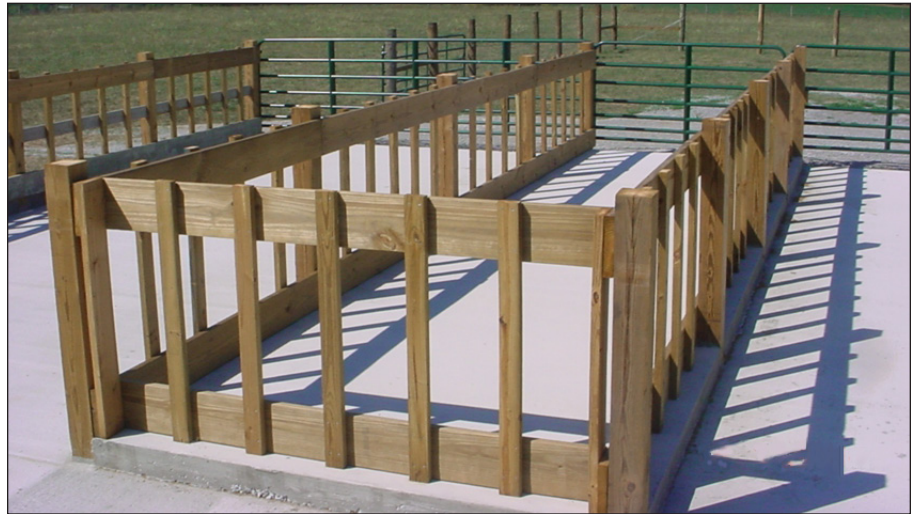
Figure 1. This winter feeding structure protects pastures, reduces labor, and decreases costs.

Production losses can occur if wintering cattle are haphazardly managed. When cattle are closely confined, especially in the winter, manure and wasted hay can accumulate. The manure contains bacteria, viruses, and protozoa that increase susceptibility to calf scours and