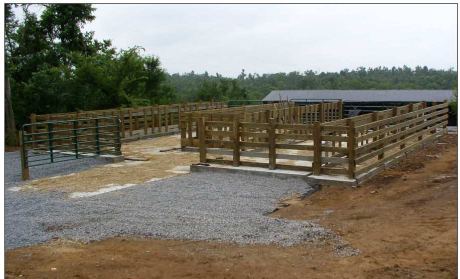
Figure 3. The heavy use area pad at the entrance of the structure provides a solid, stable surface that prevents cattle and equipment from creating mud.

Manure from the area should be collected and stored until it can be land applied to a crop or forage to effectively utilize the nutrients. A nutrient management plan (NMP) should be developed to calculate land application rates based on soil test results, realistic crop yields, and the concentration and amount of nutrients in the manure. The main goal of the NMP should be to protect local surface and groundwater quality. A rotational grazing structure for winter feeding can help accomplish that goal, along with improving production and preserving pasture quality.